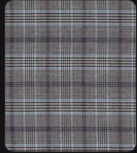
Principe de Gales